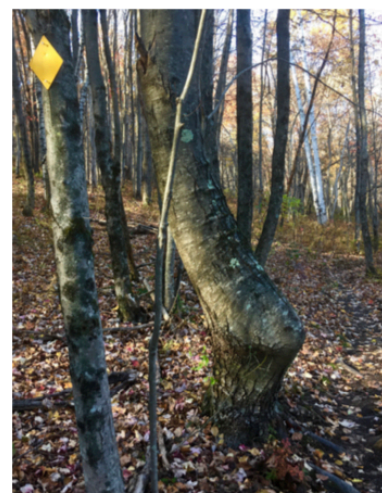
Yellow Diamond trail marker next to the Knee Tree

The hike begins from parking ( 41.742389, -72.972278 ) on either side of Scoville Road near the stop sign for route 69. It is called the Highland Trail because it reaches an elevation of 1,079 feet, the highest of any hiking trail in Burlington. In the winter, at about 2.2 miles, you can see through the trees to Meriden Mountain, the WRCH radio tower and WVIT television tower on Rattlesnake Mountain, and the water tower on Chippens Hill in Bristol.