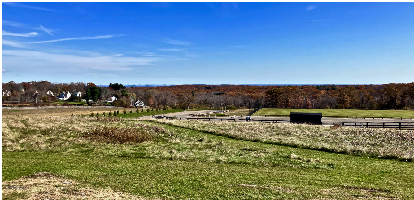
View from the highpoint

Park near the book sharing library on Johnnycake Mountain Road ( 41.760974, -72.999600 ) The trailhead starts on the east side of the fence behind the book sharing library. Turn right to follow the very wide mowed trail along the inside of this fence. The fence ends close to the Pavilion, where the hike continues around it, before reconnecting to the wide mowed trail heading northwest. The trail then turns 90° to the southwest passing 2 beautiful viewing benches on benign rocky ledges. This counter-clockwise hike returns to your car at 0.3 miles, but your elevation change profile will look impressive. You might also want to double your workout and visual experience by hiking it again, but in a clockwise direction.